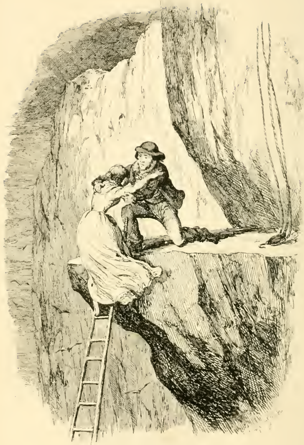
Look how safe his rough work